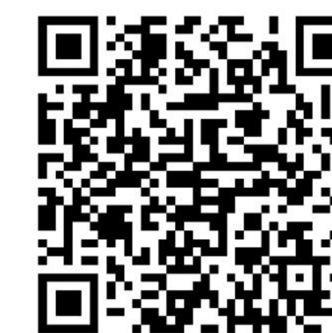
Major List of Master Programs

Scan the QR code below to see the 2025 Major List of Postgraduate Programs for International Students at Beihang University.