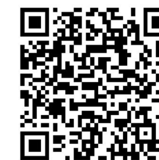
Major List of Doctoral Programs